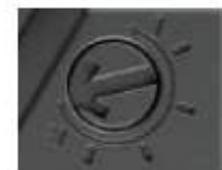
audio mix control

Note: The line level audio mix control is located on the back side of the unit next to the mode selection switch.